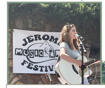
Art and Wine Walk - December 2 4-7 PM Live bands throughout town showcasing our amazing galleries and businesses