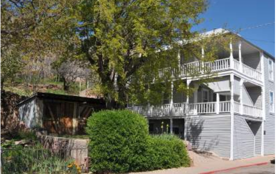
The Rooming House / Phinney House

As always, the Jerome Chamber needs all the help possible for this huge undertaking and welcomes volunteers. Be a docent, van loader, or perhaps a driver. Please contact Chamber President