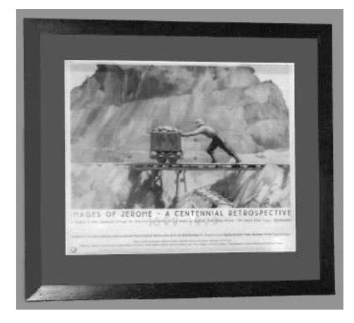
One of the many beautifully framed posters, maps and artwork featured in the Old Book Room.

For emergencies, always call 9-1-1 . For all other situations, call police dispatch at 634-2245 .